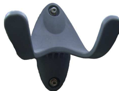
iSCAN100 Wall Mount Holster